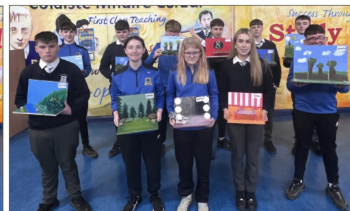
Photos show our 5 th and 6 th year LCA students celebrating their achievements. Sixth year students received their Session 2 results, including Graphics and Construction , Hotel, Catering and Tourism , and Career Investigation Tasks , while Fifth year students completed their General Education Tasks , showcasing their creativity through wire sculptures in Visual Art . Congratulations to all our LCA students on their hard work and success throughout the year.