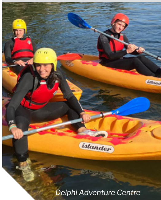
Delphi Adventure Centre