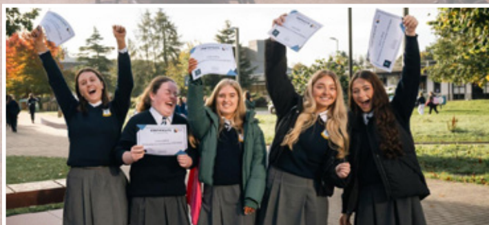
STEM Passport for Inclusion Graduation at Maynooth University #WomenInSTEM

“The focus on care is also supported by teachers who act as class tutors and by assistant principals whose role as year heads is centred on student care.