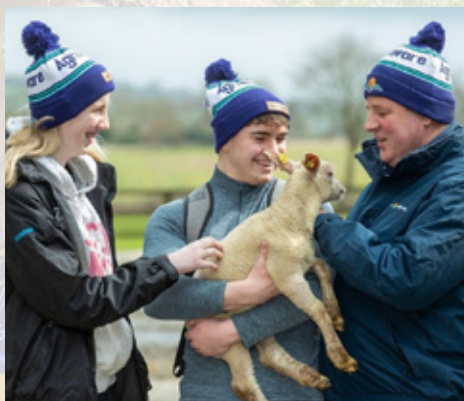
Agricultural Science Farm Walk & Talk visit