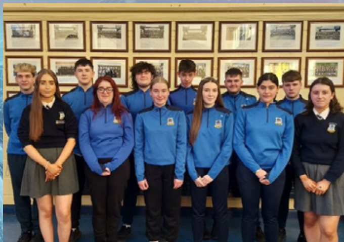
Student Digital Team

Proud to announce that we are the only school in Thurles to have achieved the prestigious