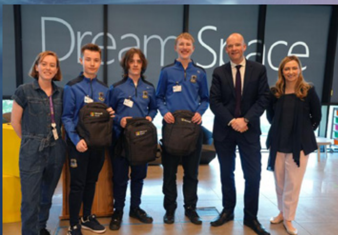
Junior Cycle Coding students proudly representing CMCO in the RTE Learn Microsoft Dream Space brAln_waves National Final

We set up a Google Classroom for our incoming first years which includes: