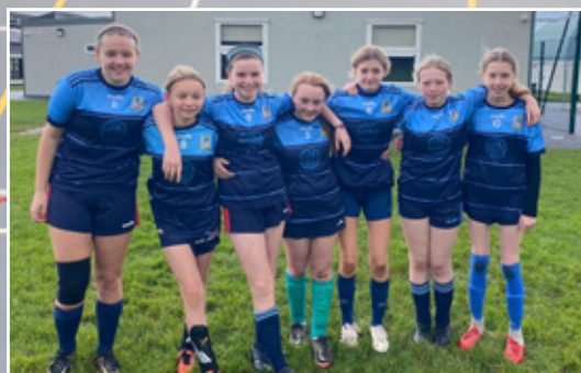
Junior Ladies Soccer team members