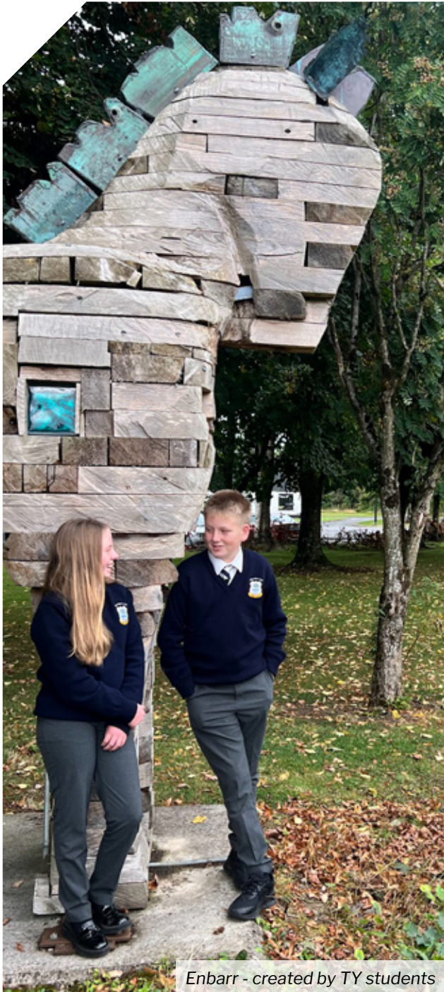
Enbarr - created by TY students