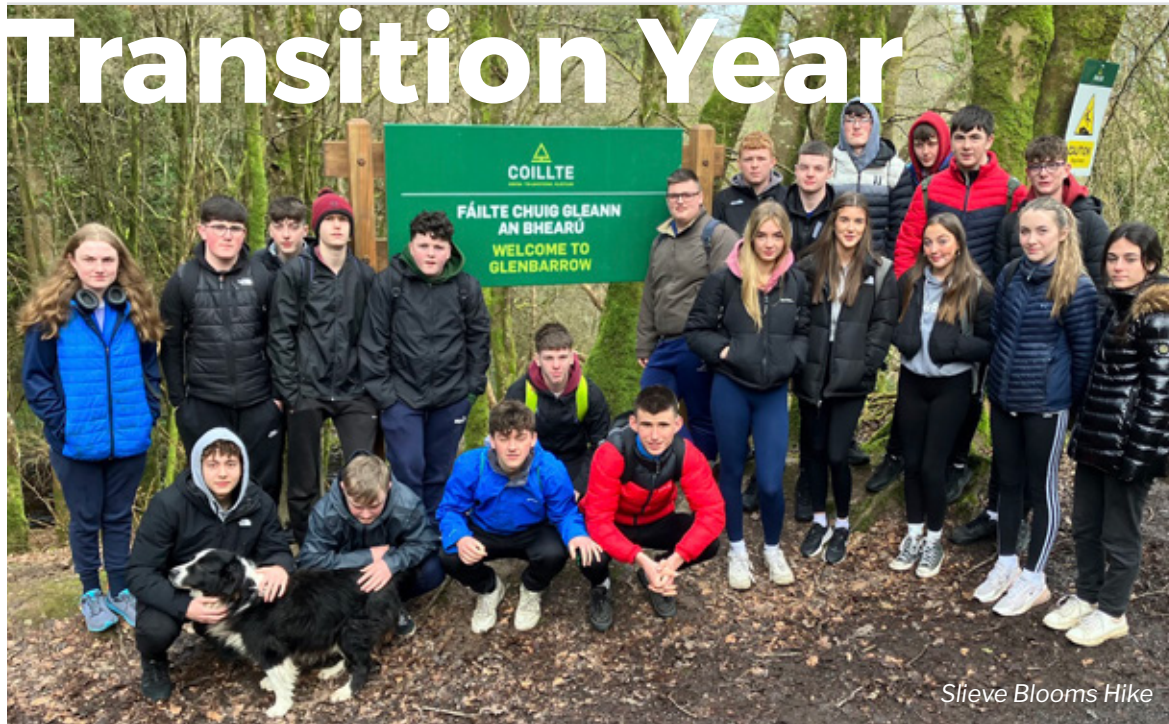
Slieve Blooms Hike

At Coláiste Mhuire Co-Ed. we have developed a vibrant and innovative Transition Year programme based on the following principles: