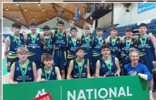
2024 All-Ireland u/16 Basketball Champions