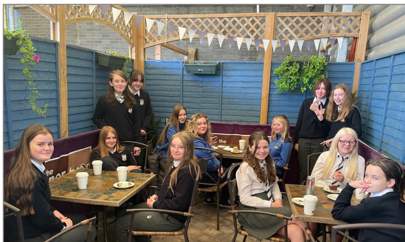
Photo shows CMCO 1 st year students enjoying delightful treats with their 'Le Chéile' leaders at the Runner Bean café in Thurles. 'Le Chéile' is our buddy system for first year students, whereby trained senior students help first years settle into their new school and feel safe and happy!