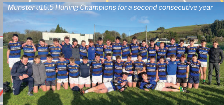
Munster u16.5 Hurling Champions for a second consecutive year