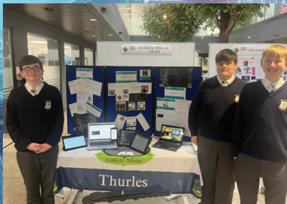
Junior Cycle Coding students proudly representing CMCO at the BD STEM Stars competition

“Effective methodologies were used by teachers and students during lessons. Student use of digital technology was a feature of many lessons.