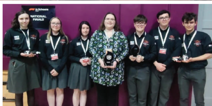
F1 in Schools Champions

“The focus on care is also supported by teachers who act as class tutors and by assistant principals whose role as year heads is centred on student care.”