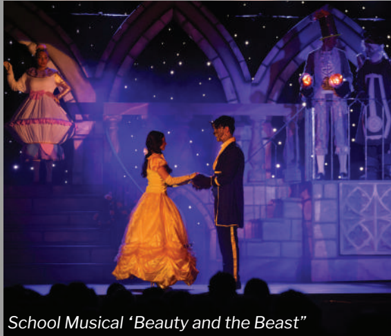
School Musical 'Beauty and the Beast'

Les élèves à Coláiste Mhuire Co-Ed. aiment apprendre le Français et participer au théâtre, à la semaine française, au cinéma français et ils aiment aussi créer les films français.