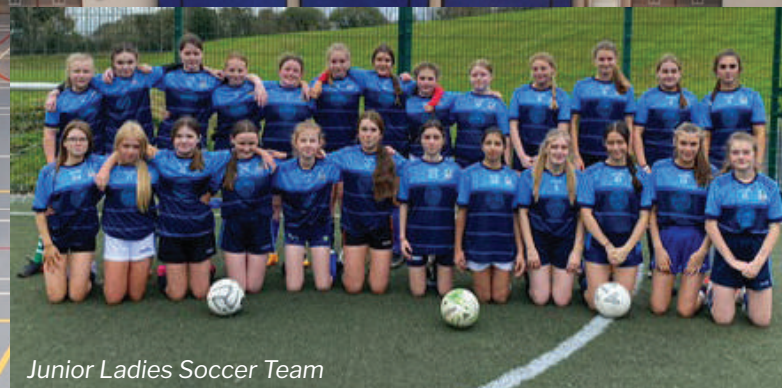
Junior Ladies Soccer Team