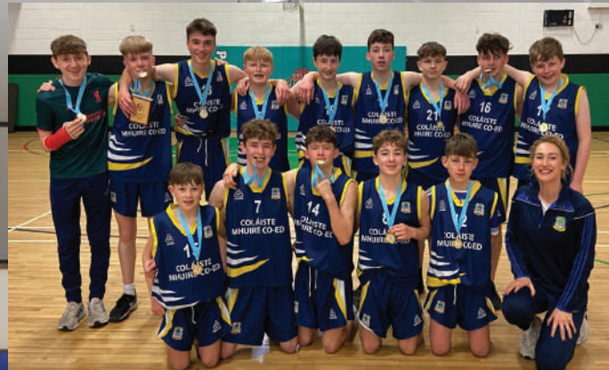
2023 Midlands Boys Basketball Plate Champions

We participate in the Active School Flag Initiative.