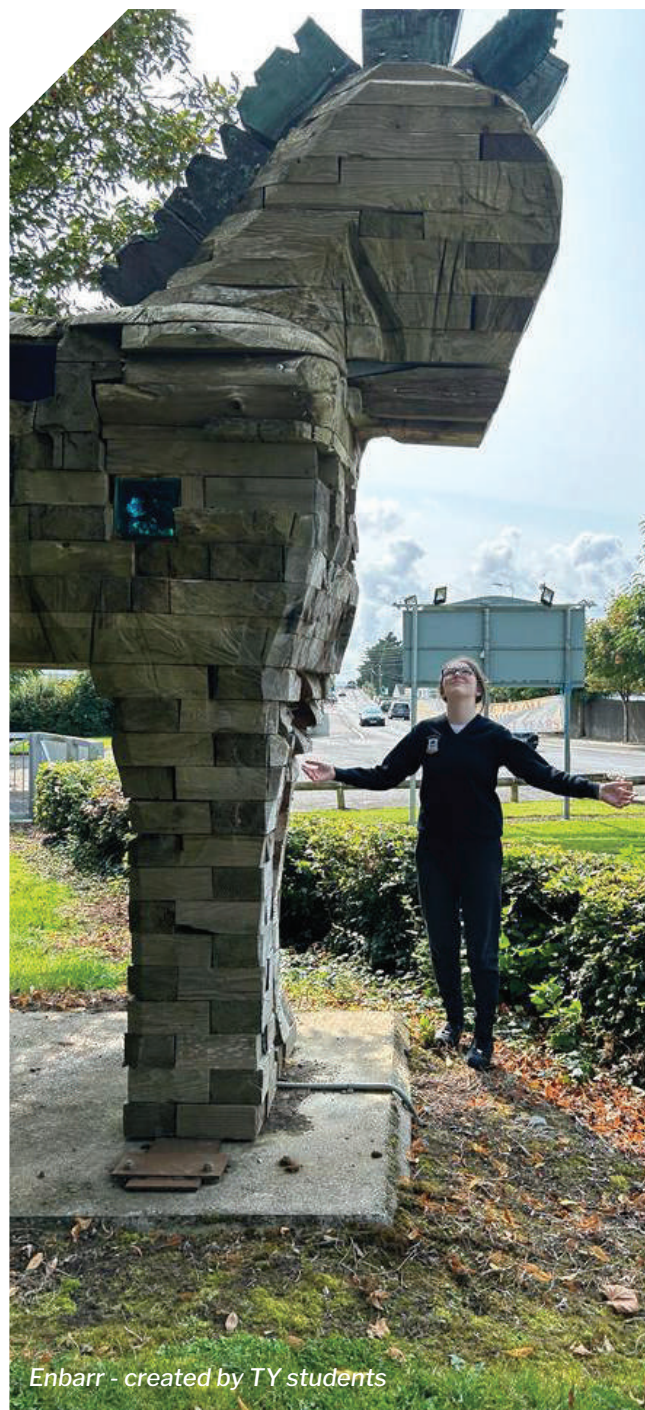
Enbarr - created by TY students