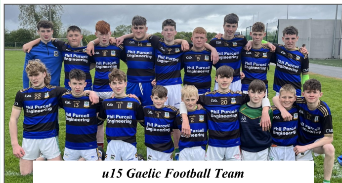
u15 Gaelic Football Team