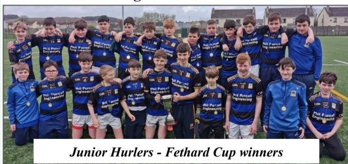
Junior Hurlers - Fethard Cup winners