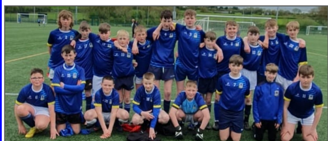
u14 Soccer team who competed in the South East Cup