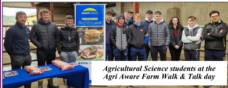
Agricultural Science students at the Agri Aware Farm Walk & Talk day

In March, LCA students and Leaving Cert Agricultural Science students enjoyed a very informative Open Day and Agri Aware Farm Walk & Talk Day at Kildalton Agricultural College in Co Kilkenny. Students and teachers received tours of the Agriculture, Horticulture and Equine Studies facilities and gained lots of practical knowledge from the experts. #excellenceineducation #community