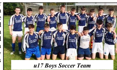
u17 Boys Soccer Team