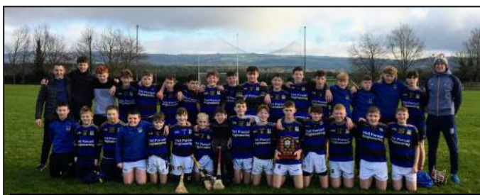
u15 County Hurling Champions: CMCO defeated Scoil Ruáin Killenaule 4:10 to 2:09 in the final