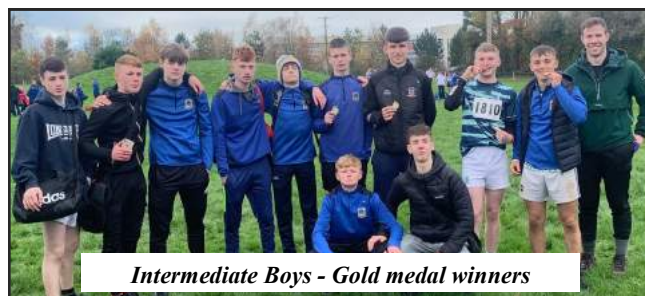
Intermediate Boys - Gold medal winners

boys topped the podium with fantastic performances from several runners. CMCO also won the award for best overall boy's school section. #cmcoabú