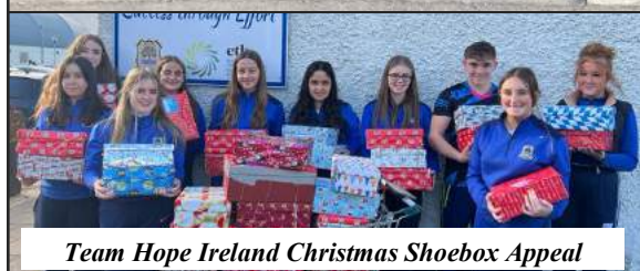
Team Hope Ireland Christmas Shoebox Appeal