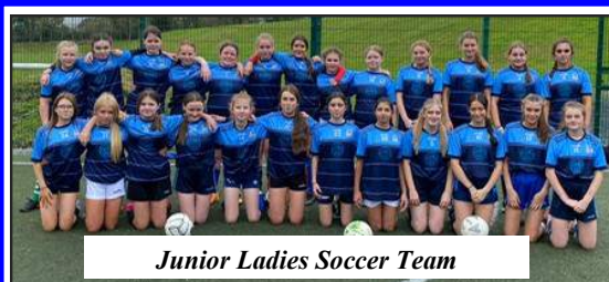
Junior Ladies Soccer Team