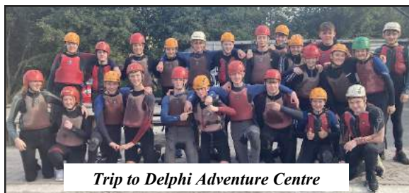
Trip to Delphi Adventure Centre