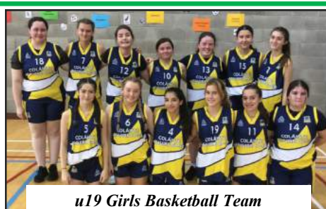
u19 Girls Basketball Team

Both girls and boys u16 and u19 basketball teams played some very competitive basketball in their group matches, gaining confidence after every game. Our u16 boys team progressed from the group stage to defeat Ardscoil Phádraig in Longford by 25 points in the Midlands quarter-final. They met a very strong Portlaoise side in the semi-final and were unfortunately defeated.