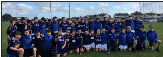
1 st year Hurling Team won the Pláta Uí Cathain in the Tipperary County Blitz final against Carrick CBS