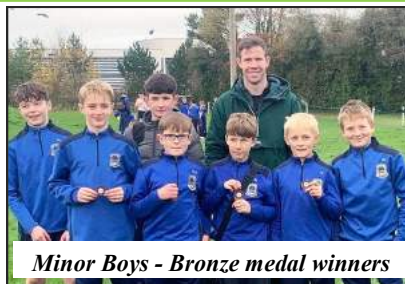
Minor Boys - Bronze medal winners