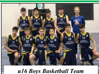
u16 Boys Basketball Team