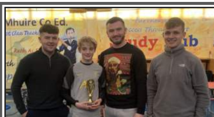
Table Tennis Tournament