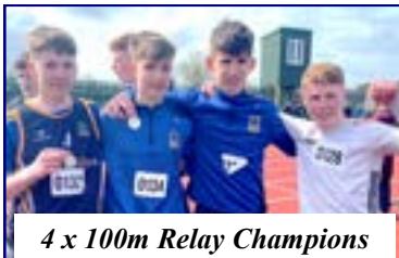
4 x 100m Relay Champions