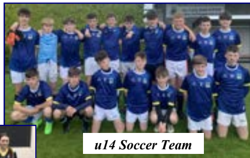
u14 Soccer Team