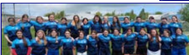
1 st & 2 nd year girls who competed in the Tipperary ETB Multi Sports blitz recently