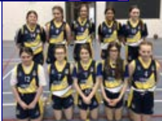
Left - 2nd year girls Basketball team who narrowly lost the Midlands semi final.

Recent CMCO Sports highlights...lots to celebrate this year!