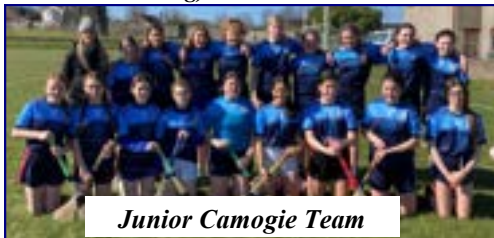
Junior Camogie Team