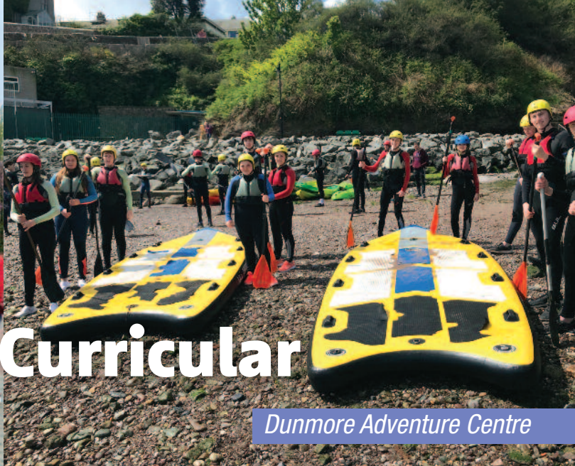
Dunmore Adventure Centre