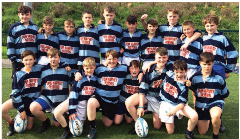
Our thriving u/14, u/15 and Senior rugby teams have enjoyed success in Munster Development Schools, Munster Cup and Blitz competitions in Thomond Park.

Other activities are catered for upon interest