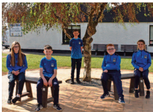
Students relaxing in one of our new outdoor spaces

The atmosphere in the Bialann is second to none. Lovely to see students mixing and eating nutritious food!