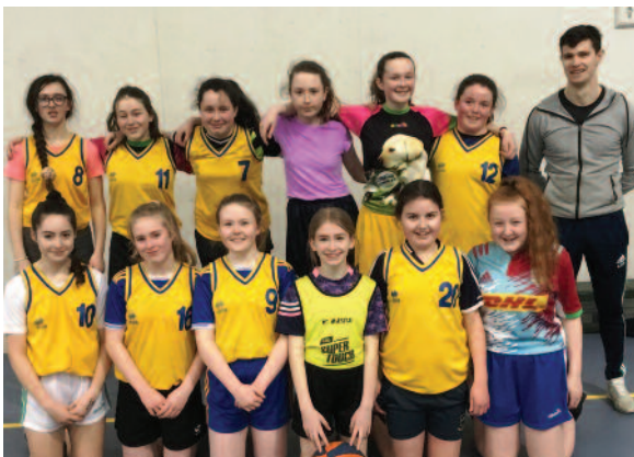
Junior Girls Basketball Team