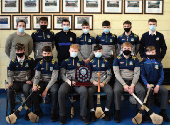
County Champions - Holycross-Ballycahill GAA players with the U17 County League Hurling Final trophy.