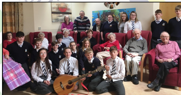
Photo shows some of our students rehearsing with the residents.