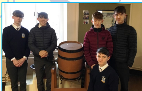
Photo shows some students viewing conditions from a bygone Ireland in the early 20 th century where farmers were self sufficient, schooling was uncompromising and Broadband & Snapchat were literally centuries away!