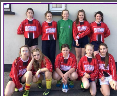
Photo shows our 1 st year girls team who participated in the FAI Futsal competition and enjoyed three competitive matches against Templemore, Borrisoleigh and Roscrea.