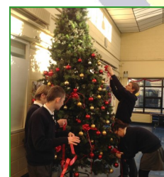
Students help to decorate the Christmas tree.