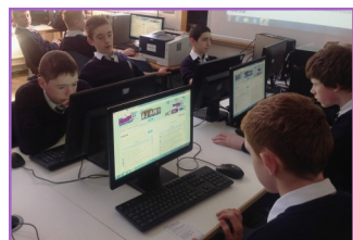
Photo shows 2 nd year Science students asking challenging questions to scientists in a fast-paced online chat as part of the "I'm a Scientist Get me out of Here" event that they participated in during Science Week.