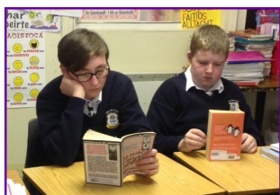
Photos of students participating in the reading for pleasure action which is part of our Literacy SSE.