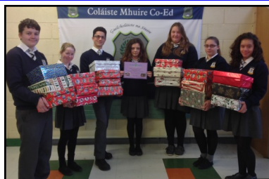
Photo shows TY students with the Christmas Shoeboxes they collected on behalf of Hope Ireland.