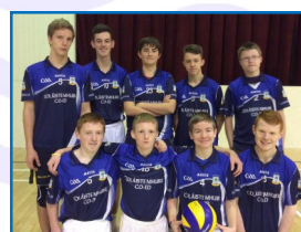
Photo shows the Senior boys Volleyball team who were narrowly beaten by Mountrath College from Laois in their semi-final contest.

Our u15 Boys Volleyball team played three competitive matches in a tournament in Mountrath against Coláiste Íde, Mountrath Community School and Dungarvan.