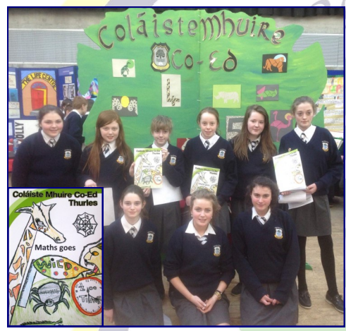
Photo shows 1<sup>st</sup> year students attending the Make a Book Exhibition in Cork City Hall where they presented this year's publication "Maths Goes Wild".