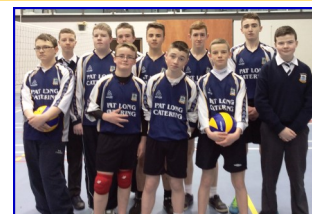
U15 Boys Volleyball team who played in the All-Ireland Quarter Finals of the Schools Volleyball Championship.

Congratulations to our Gaelic Football teams who defeated Borrisoleigh and Newport this year and to our 1 st years who were runners up in the Fethard tournament.