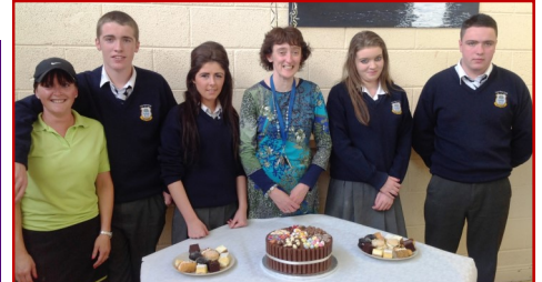
Photo shows some 6 th LCA students enjoying their graduation meal.