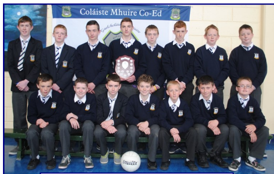
u14 Gaelic Football team