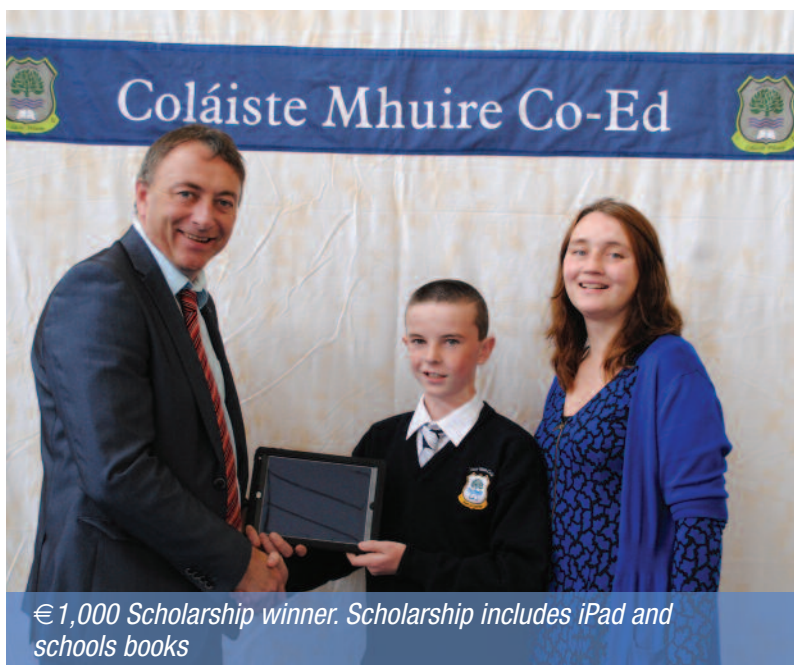
€1,000 Scholarship winner. Scholarship includes iPad and schools books

Our induction programme begins in January, and includes sixth class students coming to the school on four occasions. During this time they will meet their new friends and teachers, engage in team building activities and learn the geography of the school.