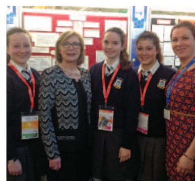
Minister for Education with our students at the BT Young Scientist Exhibition