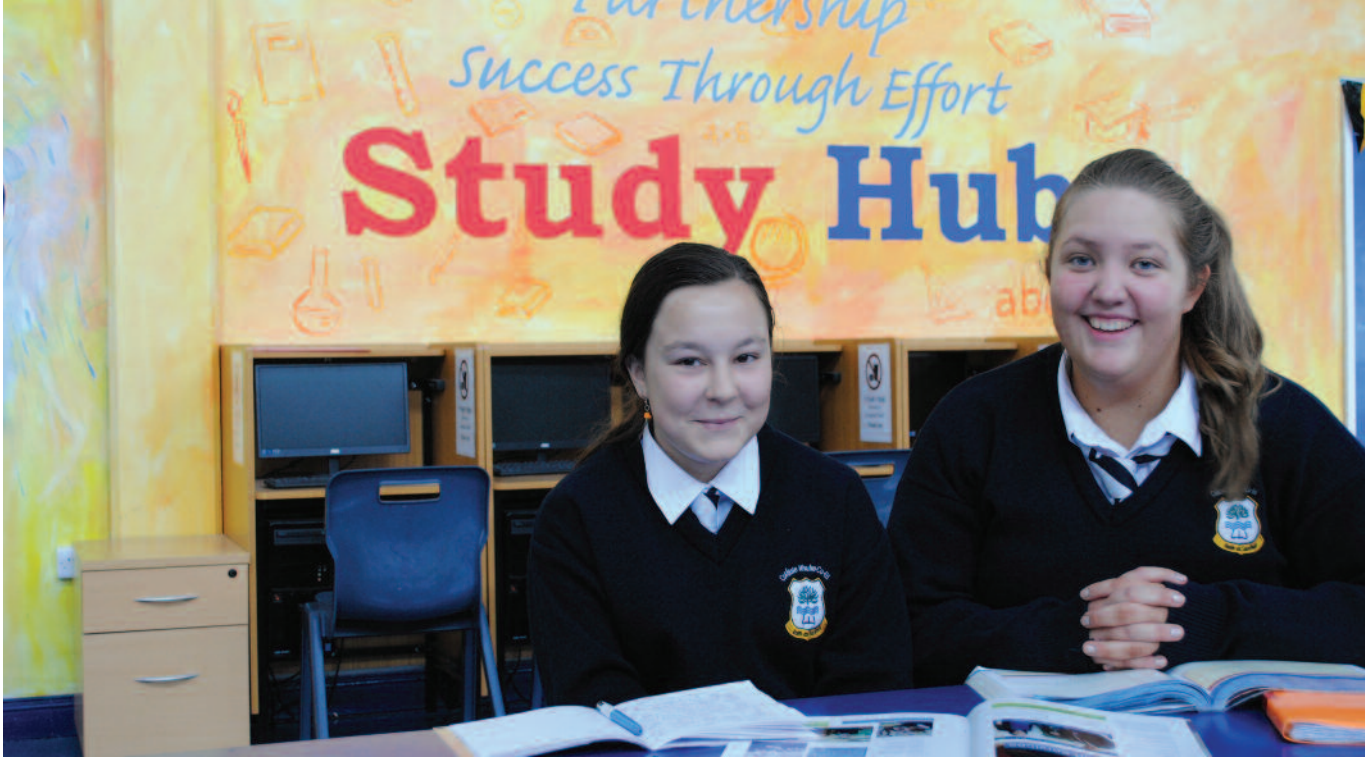
First Year student with Le Chéile Leader