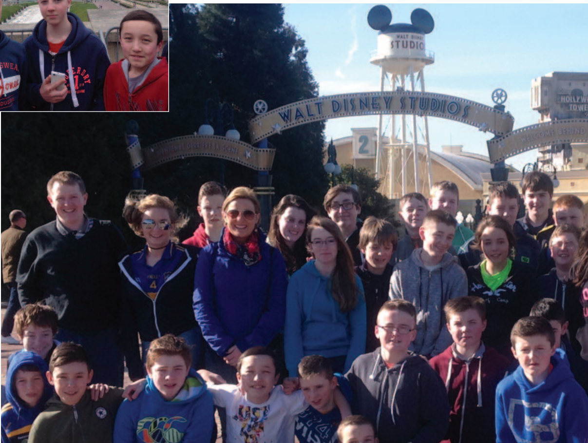
Our students on tour in Paris 2015

All First Years participate in these productions.